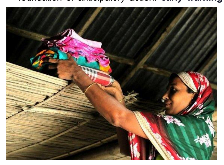
Women store items to prepare for a flood 1 Women store items to prepare for a flood in Bangladesh

Anticipatory action involves the deployment of resources and interventions based on early warning systems and predictive analysis. There are three key components that form the foundation of anticipatory action: early warning systems , early actions and pre-arranged