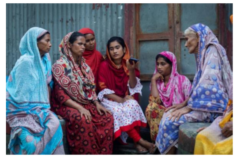
Women in Gaibandhadistrict in Northern Bangladesh listening to flood information voice messages

5. Tailor Information Dissemination: Customise communication information dissemination strategies to suit the local context and ensure the accessibility of forecasts and early warnings. Utilise multiple channels, including community radio stations, community meetings and mobile technology, to reach a wide range of community members, including those who may have limited access to formal information sources.